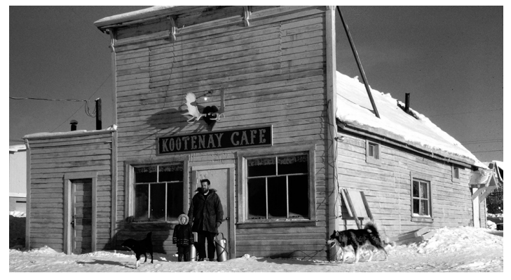
After the Kootenay burned, Atlin was left without a Café, so the author's parents rented the Moose Hall and reopened the Kootenay Café in that location.

Atlin's recreation center showed an out-of-date movie every two weeks, which fueled the children's already fertile minds. They emulated the actors and became cowboys and Indians and pirates and Roman gladiators.